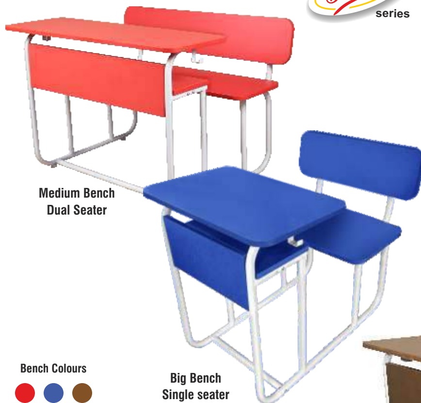
Medium Bench Dual Seater